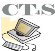
Computer Training 4 Seniors

Caritas SCSEP realizes that a majority of our participants have very limited computer skills, which makes employment seeking very difficult. Today,