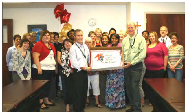
Above: The Belleville staff celebrates the 65th anniversary of the agency in 2012, the first of only two as Christian Social Services of Illinois.

Right: St. John Bosco Children's Center opened in 1992 on North Church Street in downtown Belleville in the former convent of St. Luke Catholic Church. It was initially an emergency placement center for children removed from their homes due to abuse or neglect.